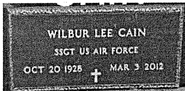
Added by RWCNAC